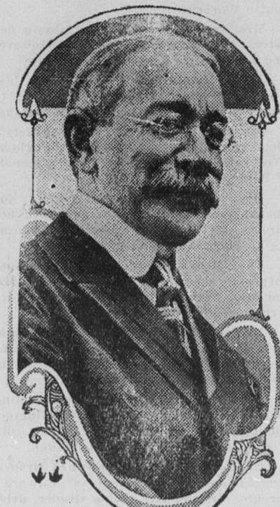
GEORGE W. WICKERSHAM Former Attorney-General of the United States.

George W. Wickersham, former Attorney General of the United States, is actively enlisted in the Nation-Wide Campaign of the Episcopal Church which is being waged for a more practical, efficient religion. Discussing the awakening of the people, as one of the outcomes of the world war, and of their dawning consciousness of power and influence in shaping the world's affairs, Mr. Wickersham says: