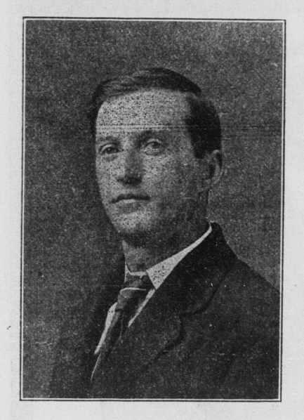
Naminee for County Auditor Thanks Voters.

To the Voters of Centre County: Permit me to express to you my deep appreciation for the splendid vote cast for me at the primary election. I wish it were possible for me to take you all by the hand and personally extend my thanks. I trust that you will kindly remember me on November 4th, when you vote. I assure you that I will prove to the people that I am capable for the office to which I aspire and that although I am a man of small stature, I will prove that I have within me a big heart. Let us, as Democrats, not forget our duty to the party, and let us feel that it is our duty to get busy and GET OUT THE VOTE.