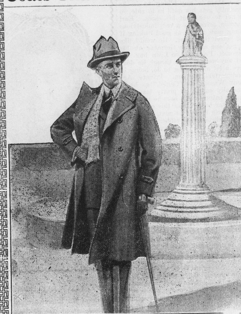
(C) 1918—STROUSE & BROS., INC., BALTIMORE, MD.

WE ASK one question in stocking an overcoat model—will it make a friend or keep one? This care in selecting is a guarantee of satisfaction in wearing. When your purchase bears the label of