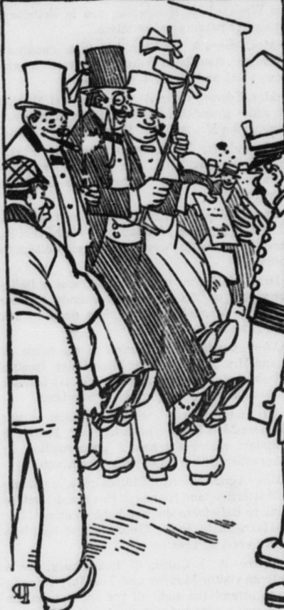
A NIGHT POLICEMAN HALTED THE PARADE.

In a short time a singular procession was seen by night revelers in the park wending its way from the main restaurant to the public road. Four sturdy messengers carried a sofa, on which reclined the count and his companions provided with napkins tied to their canes.