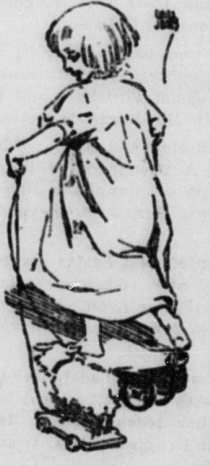
DRAGGING CARTS AND WOOLLY LAMBS.

"I beg your pardon," he said. "I've taken a great fancy to your little charge, and I want your help to carry out a plan of mine. I have suggested to Hope that she hang up her stockings tonight. I have every reason to believe that Santa Claus will get on this train at Buffalo. In fact," he added, "I mean to telegraph him." The nurse hesitated a moment. He drew his cardcase from his pocket and handed her one of the bits of pasteboard it contained. "I have no evil designs," he added cheerfully. "If you are a New Yorker, you may possibly know who I am." The woman's face lit up as she read the name. She turned toward him impulsively, with a very pleasant smile. "Indeed I do, doctor," she said. "Who does not? Dr. Abbey sent for you last week," she added, "for a consultation over the last case I had—this child's mother. But you were out of town. We were all so disappointed." "Patient died?" asked the physician, with professional brevity. "Yes, doctor." He rose from his seat. "Now that you have my creden-