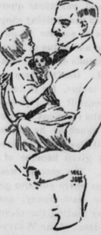
"I'LL BE YOUR OWN LITTLE GIRL."

als," he said cordially. "I want you and Hope to dine with me. You will, won't you?" Later, in the feverish excitement of hanging up her stockings, going to bed and peeping through the curtains to catch Santa Claus, a part of Hope's extraordinary repose of manner deserted her but she fell asleep at last, with great reluctance.