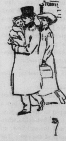
SHE NESTLED AGAINST HIS BROAD CHEST.

"Really, truly?" she asked. Then, as he nodded without speaking, she saw something in his face that was new to her. It was nothing to frighten a little girl, for it was very sweet and tender, but for one second she thought her new friend was going to cry. She put both arms around his neck and replied softly, with the exquisite maternal cadences her voice had taken on in her first words to him when she entered the car. "I'll be your own little girl, and I'll take care of you too. You know, you said I could."