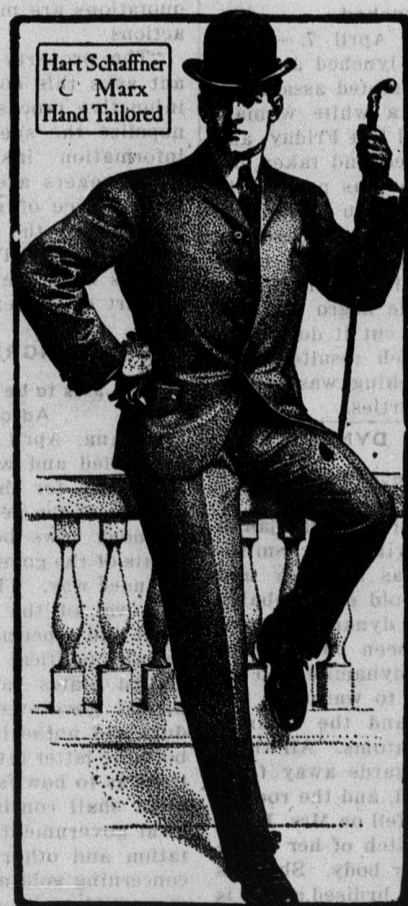
Copyright 1915 by Hart Schaffner & Marx DRAWN FROM LIFE A wearer of THE CLOTHES WE SELL. It shows how our clothes look. No need to make the pictures better than the clothes.

By which you can identify them more certainly than by the label. It goes into them before the label. Its a style, a quality, a Tailoring-by-hand touch to them, a harmony of fabrics, linings, etc., A THOROUGHbred LOOK ABOUT THEM, almost never found in other ready made clothes. The fact that we can't describe it don't make it any less real. You can see it without fully realizing what it is. We can't show it or tell you fully about it until you wear the clothes—then we don't need to. Its one of the things that makes Sim's hand-tailored clothes more valuable to the wearer than the ordinary ready made.