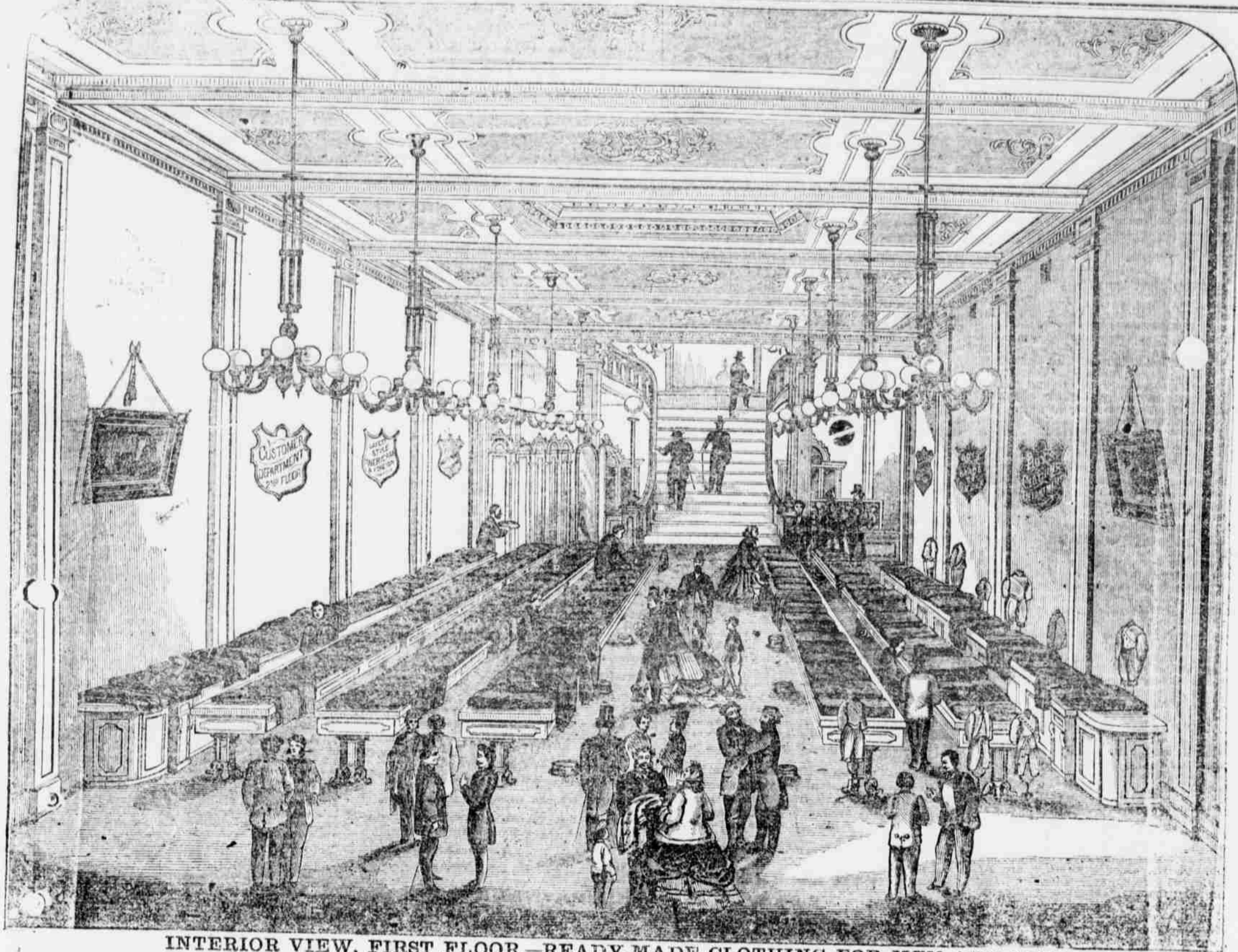
INTERIOR VIEW, FIRST FLOOR.—READY-MADE CLOTHING FOR MEN AND BOYS.

Nos. 603 and 605 CHESTNUT STREET, PHILADELPHIA.