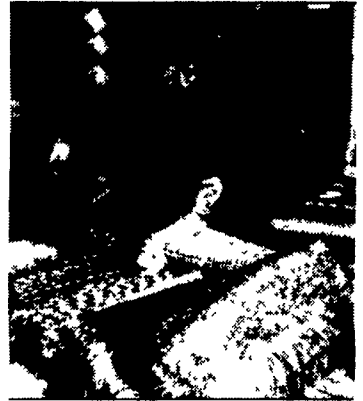
A shopper examines woven rugs, placemats, and table runners handwoven by Stoltzfus Custom Weaver.

from a Lancaster County Amishman. They use a variety of methods from gourd burning to etch in a design to fine art to transform the gourds.