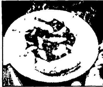
Rustic Apple Cranberry Tart adds a festive touch to holiday tables.

Bake 15 minutes. Reduce oven temperature to 350 degrees. Bake 40-45 minutes or until fruit are bubbly and crust golden brown. Makes 8 servings.