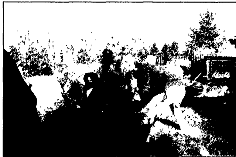
Nick Auiso and Tony Force wrap the soil ball of the tree, preparing to move it to the garden center for sale.

“Christmas tree growing is a full-time, year-round business,” said Veto. “Certain aspects of the tree production process are an all-year thing. As for preparing for the actual harvest, we usually start mid-October getting every-