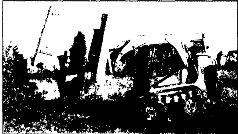
Veto Barziloski extracts a tree to prepare it for sale as a live Christmas Tree.

"We market the concept behind a Christmas tree," said Veto Barziloski. "You're selling an ex-