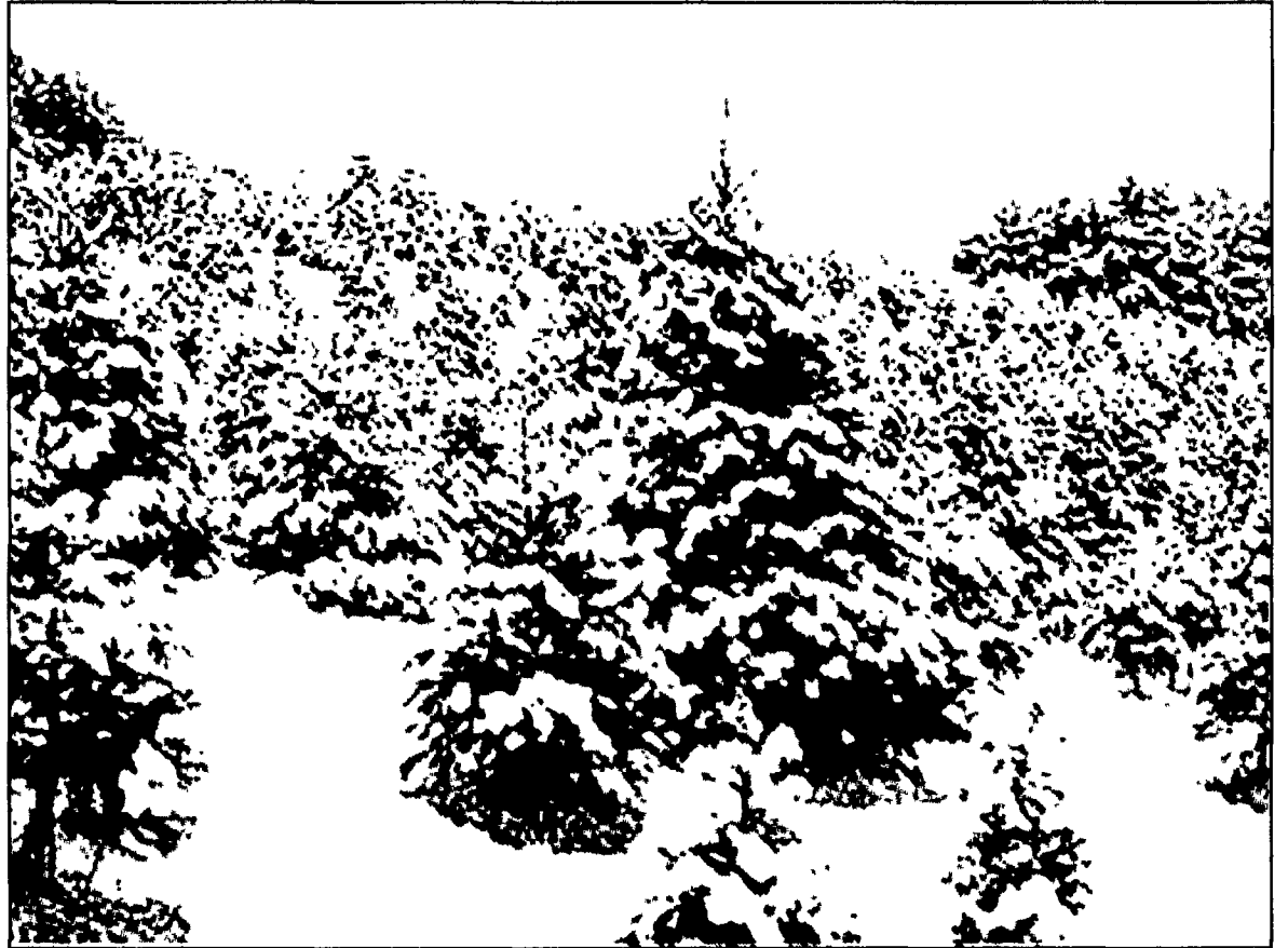
Snow-covered trees at DeLong Christmas Tree farm in Knauers.