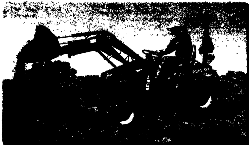
MF Garden Compact Tractors