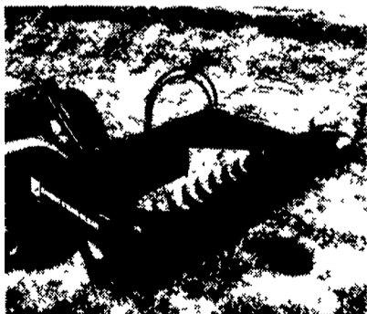
Silage defacers 96-in. working width