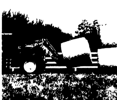
Full family of telehandler and loader attachments