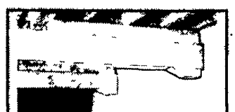
Keystone Knuckle Beam System helps support pit wall (NCRS approved)