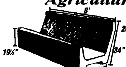
Slant-back J-style Feed Bunker