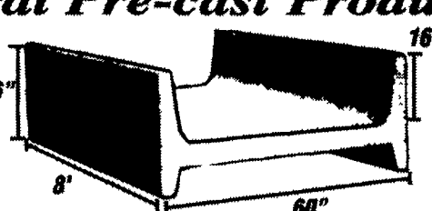
High Capacity H-style Feed Bunker