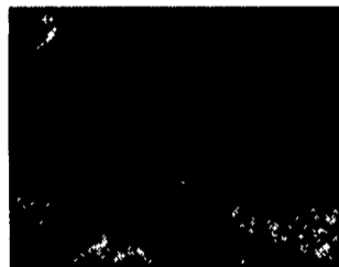
► Powerful enough for all of your tough workshop, garage, and basement messes—wet or dry