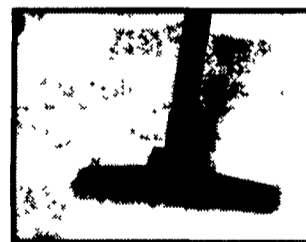
► Convenient for kitchen spills and clogged drains