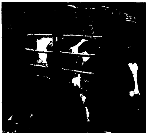
Once in the chute with the belly band winched into working position, the cow is safely secured for foot treatment.

Side panels and gates easily replace hoof care accessories to create a vet chute where almost any common vet procedure can be performed.