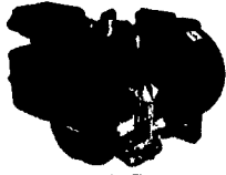
3.5 HP Briggs Part# B500122 Size 2"

Suction Lift Up to 25 feet Max Flow 230 U.S. GPM Engine 3.5 HP Standard B & S