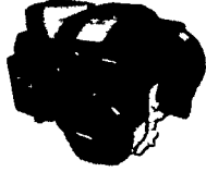
5.5 HP Briggs Intek Part# B500126 Size 2"

Seal Protek double seal Suction Lift Up to 25 feet Max Flow 230 U.S. GPM Engine 5.5 HP B & S Intek® OHV