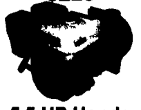
5.5 HP Honda Part# B500127 Size 2"

Seal Protek Double Seal Max Flow 230 U.S. GPM Engine 5.5 HP Honda OHV