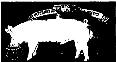
Champion York Boar 2002 Keystone The Kind We Sell

(Both Purebred & Fi's ready to breed - from very productive sow families.