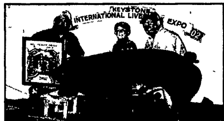
Supreme Grand Barrow 2002 Keystone The Kind We Sell (A Super Champion)

Many bred gilts for great toppers & PPA projects, welcome for next year.