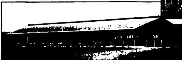
47' x 180' Three Row Freestall Barn