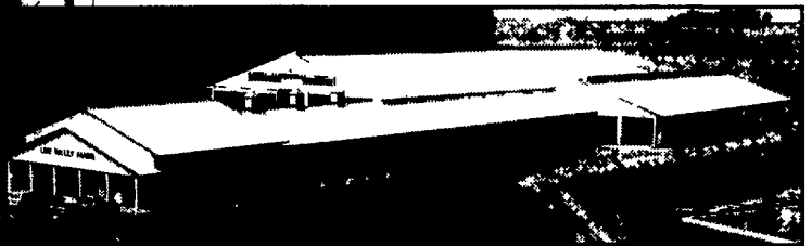
Free Stall Barn & Milking Center

Large or Small, Contact King Construction For Design and Construction