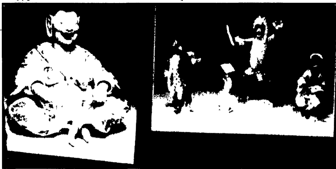
Meissen nodder figure and several monkey band figures, c.1860s, also Meissen. Photo credit: Alexander's Antiques. The Manhattan Art & Antiques Center.