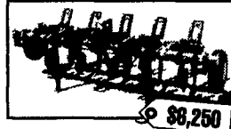
C 45008 UM 5 Shank 12' Subsoiler MRD Shanks - Spring Reset 2" Points, 9 5x15 Tires 30" Spacing Gauge Wheels