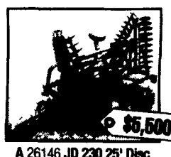
A 26146 JD 230 25' Disc