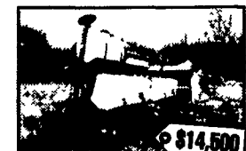
C 32356 CH 900-6RN Planter, Liquid Fert, Markers, 13" Coulters, 16.5" No-Till Coulters, Early Rear Monitor, 1000 RPM, (6) 12.5" Fertilizer Openers