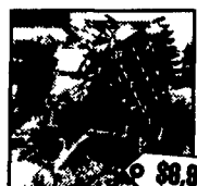
B 44430 IH 406-22' Disc, Hydro Fold, 9" Spacing, 20" Front Blades, 21" Rear Center Duals