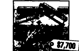
B 44700 UM 28' Basket