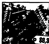
B 32119 CH 406-26' Disc, Rockflex-Double C Arms Blades Frt 20", Rear 21" Cyl & Hoses, Scrapers, HydraulicWings, 7 5" Spacing