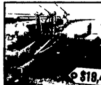
B 24499 1993 Great Plains 30' NT Drill, 3" Press Wheels, 48x7 5" Spacing, New Openers