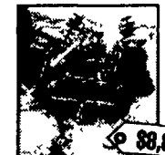
B 45172 CH 3800-19' Rockflex Disc, Folding, Blades 20 5 Ft, 21" Rear 9" Space Center Duals, Cyl/Hoses, Pkr Htch/Hoses, Fur Fill, Scrapers