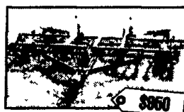
B 43751 IH 15' Field Cultivator, C Shanks, 6" Spacing, Good Frame, Field Ready