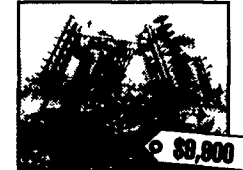
B 44971 KR 3127 Landman, 27' C-shanks, 16-17" Blades