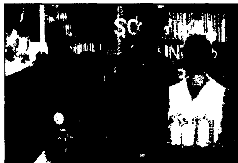
Supreme champion dairy cow — Milk exhibited by Erica Rhein.