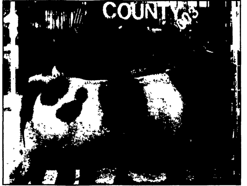
Grand champion dairy beef steer exhibited by Cloyd Troxel.