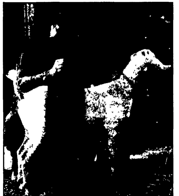
Grand champion market goat exhibited by Douglas Masser.