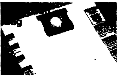
Efficient Filtration for Easy Clean Up