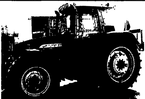
01 Fendt 716, 140 HP, 4x4, Cab, 800 hrs, Warranty $89,000