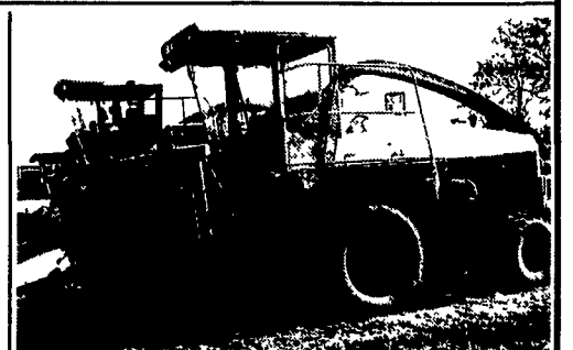
Claas 695, w/6 Row Kemper Head, 10' Hay Head, Corn Cracker, 4x4 $78,000