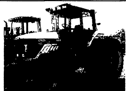
White 6125 122 HP, 4150 Hrs., Power Shift $32,000