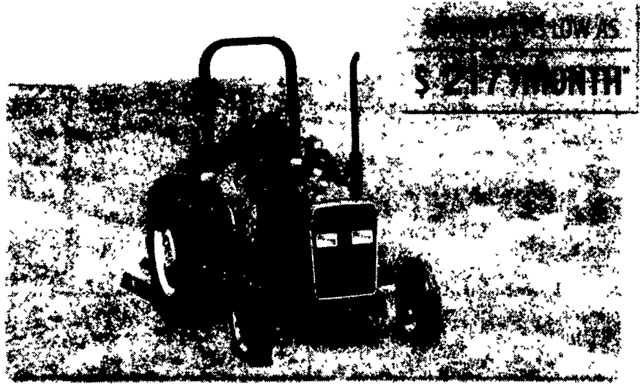
MF 231S Tractors

GETS DOWN TO WORK. KEEPS DOWN YOUR PAYMENTS.