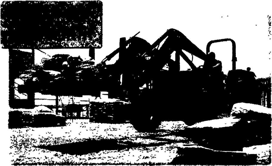
MF 481 Tractors

Located: 4 miles West of New Holland on Rt. 23, 1-1/2 miles Northwest of Leola on the No. Groffdale Rd., 1 mile on the right, opposite Groffdale Mennonite Church.