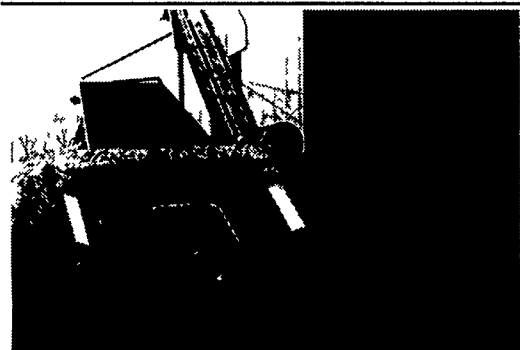
N.I. 324 Corn Picker, 2 Row Wide, 12 Roll Bed $2,650