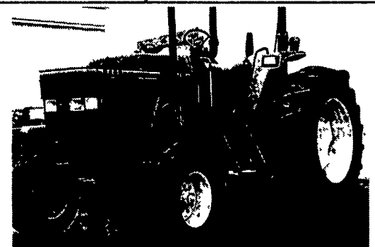
98 J.D. 6400 Syncro Plus, 540-1000 PTO, 2 Hyd. $16,500