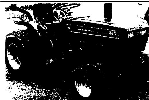
C.I.H. 235 - 18HP Diesel 4x4 Hydro - 3pt. 809 hrs & nice $5,900