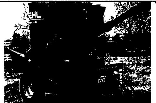
Gehl 170 Grinder/Mixer, Gray Decal $6,400