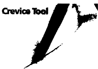
▶ Hard-to-Reach Spots