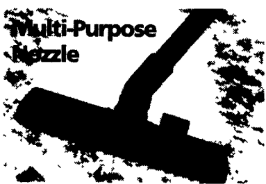
▶ Carpet/Bare Floors