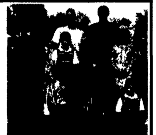
New Creation Team