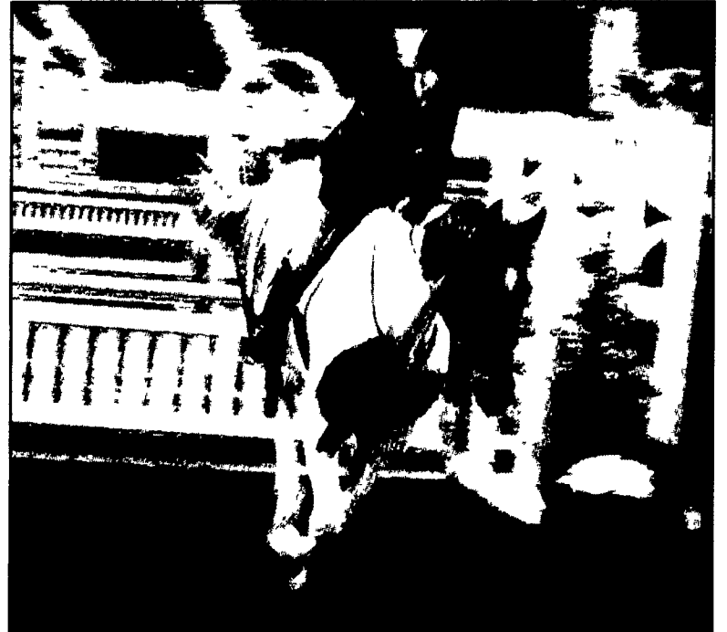
HARRISBURG (Dauphin Co.) — A rider and equine competitor finish taking a fence at the recent Pennsylvania National Horse Show, conducted here at the Farm Show Complex Oct. 9-18. Competition included junior, open, and amateur owner hunter competition and several North American League finals events. The horse show also included a hunt night with terrier racing and a horn blowing

championship, kids' days that featured free pony rides and face painting, appearances from the Budweiser Clydesdales and the Royal Canadian Mounted Police, a "Stars of Showjumping" autograph session, and the Budweiser Grand Prix de Penn National. Watch for pictorial coverage of the event in an upcoming issue of Lancaster Farming's Boarder & Trainer.