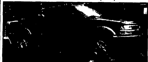
99 Chevy S10 4WD 4.3, AT, A/C, PW, PDL, Tilt, Cruise, Cass/CD, 55,000 Mi., Blue & Gold $11,500

1589 Division Hwy., Ephrata, PA 17522 Rt. 322, 1 mi. east of Rt. 222 (717) 738-0004