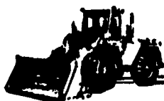
Syracuse (Evenings) (315) 637-8912

Alex Lyon & Son SALES MANAGERS & AUCTIONEERS, INC. PO Box 610, Bridgeport, NY 13030 PA Lic.# AU-0003051-E www.lyonauction.com