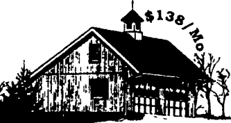
24x24 Canterbury 6.99% Financing for qualified buyers