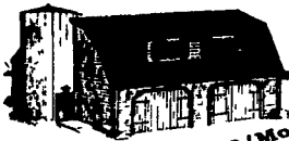
26x34 Oxford $1821/Mo

Call or go online for Your FREE Brochure