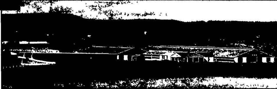
State-of-the-Art, 1,000 Cow Milking Facility