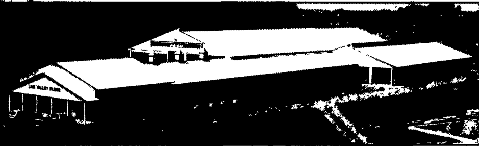
Free Stall Barn & Milking Center

Large or Small, Contact King Construction For Design and Construction