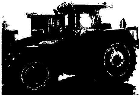
01 Fendt 716, 140 HP, 4x4, Cab, 800 hrs, Warranty $89,000