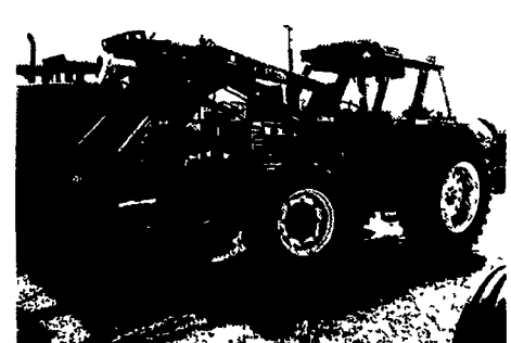
Hesston 100-90 4x4, 90HP, Cab, Loader $14,900