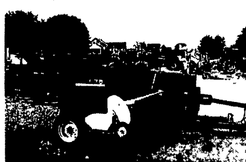
New Holland 575 Sq. Baler 14"x18", w/Thrower $10,400