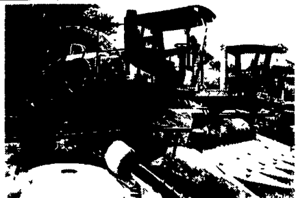
00 FX 38 New Holland 700 Cutter HR Corn Cracker, Hyd Outlet, 10' Hay, 6 Row Corn $159,900 $155,000