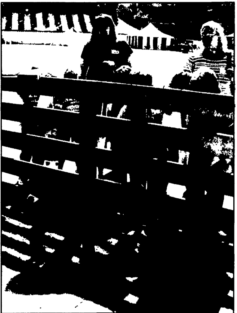
Pygmy goats are the right size for petting at Ephrata Fair.