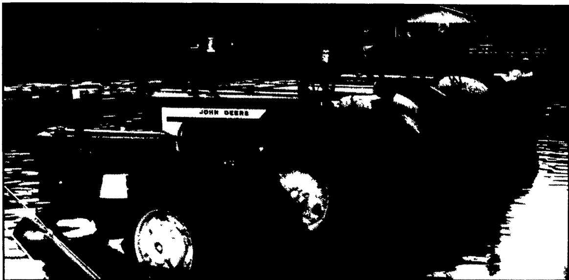
This was the scene on opening day of Ephrata Fair. Fortunately, the water receded within hours, and activities progressed as planned.