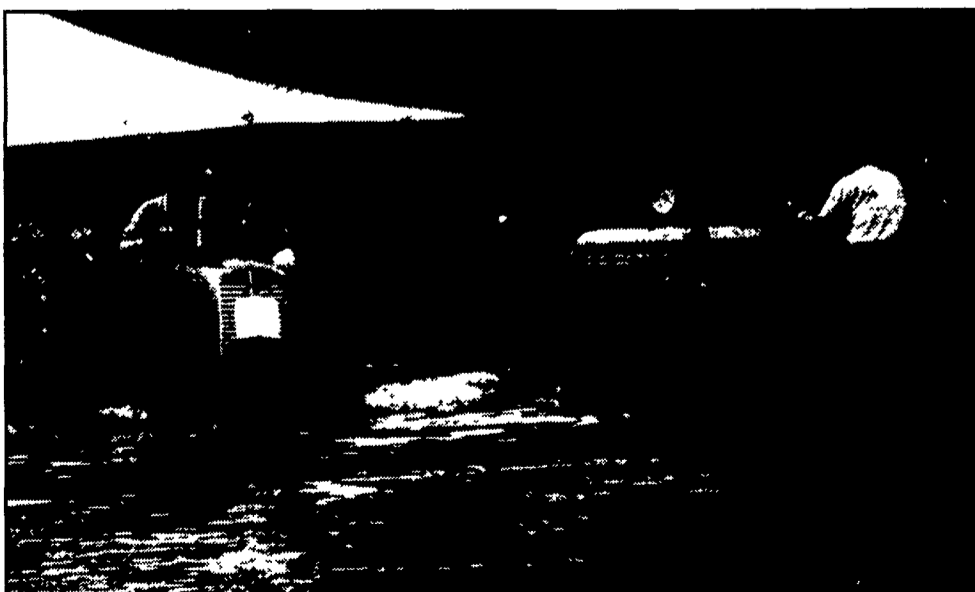
Tent City at Ephrata Fair lived through Tropical Storm Isabel early last week. The show did, indeed, go on.