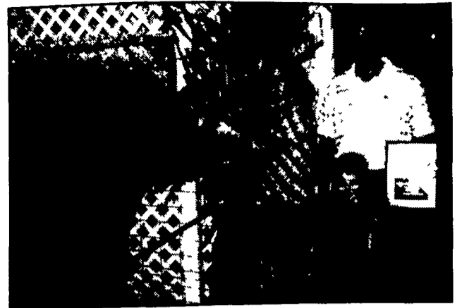
Katie Nolt exhibited Ephrata Fair reserve champion market beef. The 1,230-pound steer sold for $984 to Ted Bowers (with Mitchell).