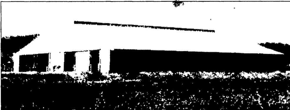
6-Row Drive Thru 200 Cow Freestall Barn

Featuring Norbco curtains, Norbco stalls, Pasture Mat pillow and cover, Bohlman concrete waterers and Empire Ventilation system