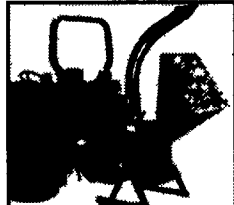
Model 73454 PTO Chipper brings a new meaning to power in a 4" chipping unit

4" PTO CHIPPER BLOWERS If a 4" PTO Chipper will handle your debris, the Model 73454. Built Bear Cat tough yet compact in design, the 4" chipper will handle your debris recycling problems.