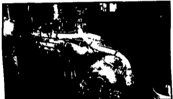
50 HP Twin Cylinder Air Compressor $1,000