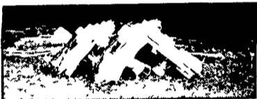
4 Pond Aerators $250/ea.