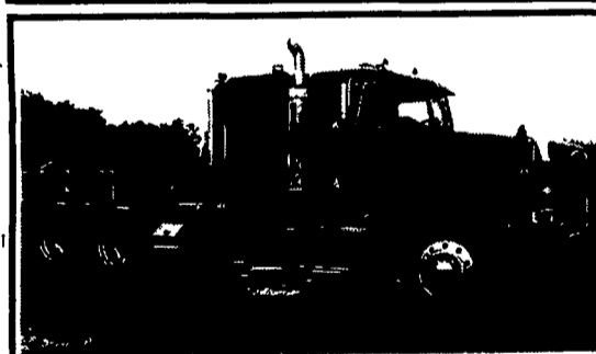
1989 Freightliner FLD120 Cummins 365, 9 Sp., 590K+ Mi., Removable Sleeper, Spring Ride, Runs Good, Strong Truck, Alum. Wheels, $6,800 717-529-2782