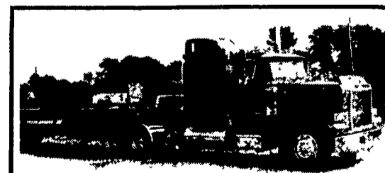
1995 Peterbilt 379 Truck Tractor 249" WB, 48" Unibilt, standup sleeper, Cat 3406E, 455 hp, Fuller RTX16710C, 10 speed trans., air leaf suspension, 285/75R24.5 rubber, alum headache rack & tool boxes, full fenders, alum wheels, 200,000 original miles, 1-owner, Excellent cond. $45,000 717-664-2444 days * 717-665-2239 eves