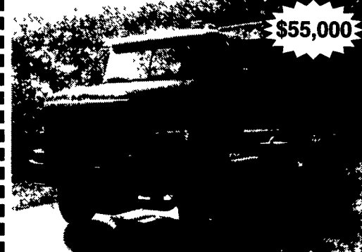
$55,000 1995 Autocar Roll-Off Detroit Series 60 with 330 HP, 98,000 Miles 3463 Hours 15K Front and 58K Rear, Allison Automatic American 75,000 o/r Auto Tarper Just Serviced Excellent Shape 973/347-1101 ask for Jim

MasterCard VISA PHONE (610) 369-9778 FAX (610) 369-9858