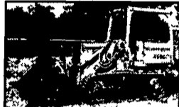
1989 John Deere 455G, OROPS, 4-1 bucket w/teeth, pedal steer, v g undercarriage & condition, 3,900 original hrs, work ready, $24,000