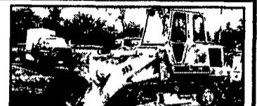
1988 Cat 952LGP, cab, gp bucket w/teeth, v g undercarriage & condition, work ready $42,500