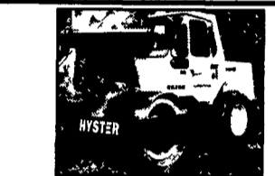
1992 Hyster C830B, 66" smooth drum, drum drive, cab w/AC, v g tires & condition, work ready, $24,000