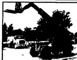
Telescopic Forklifts, Lull, Terex, 5,000-8,000 lbs, from $16,500