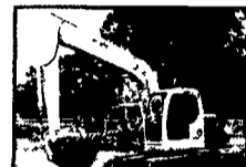
1999 Kobelco SK135LC, 31,000lb excavator, cab/ac, 42" bucket, 0 swing tail, v g u/c & condition, work ready $47,500