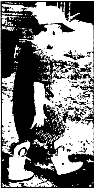
Too busy to talk.