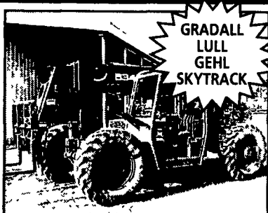
GRADALL LULL GEHL SKYTRACK