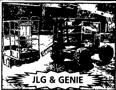
JLG & GENIE