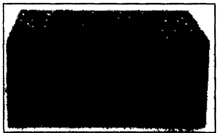
Optical illusion inlaid box by folk artist Joe Bonefont.

Years ago I found one charming, small painted box in the waste basket at a garage sale. "You want that?" was the seller's retort. For $5, I went home with a Rufus Porter type box. Porter (1792-1884) is one of the few known folk artists, who painted not only boxes but portraits, murals, landscapes and silhouettes. His boxes have sold for