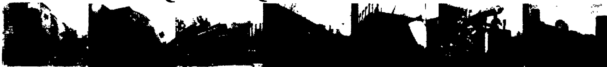
100+ Box Trailers Tanker Trailers Structural Steel Roof Supports Compactor Trailers Dsl/Gas Engines Bargrating