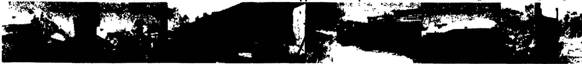
Conveyors All Sizes Elec Lifts All Types Building Structures Mobile Barriers Flatbed Trailers Chem Trans Trailers Cardboard Crushers