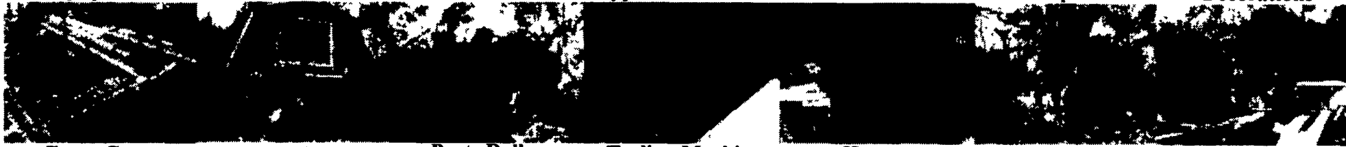
Fence Gates Free Standing Sheds Parts Rollers Tooling Machines Heaters 1 of Many Cranes Aerial Lifts