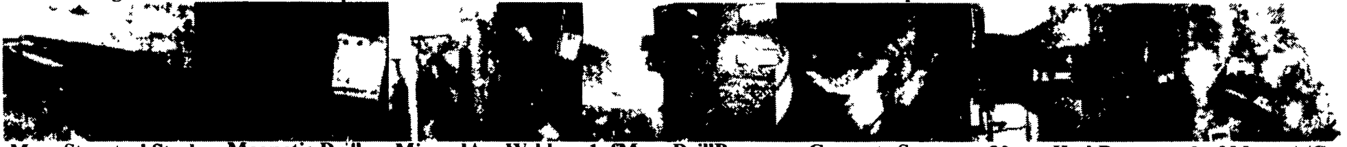
More Structral Steel Magnetic Drill Migand Arc Welders 1ofManyDrillPresses Concrete Saws 80 ton Hyd Press 2 of Many A/C