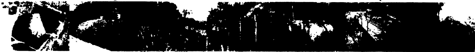
1 of Many Wrecking Balls Elgin Pelican 3 Wheel Sweeper Wrecking Balls and Buckets 300+ Demo Trailer Braces Fuel Tanks w/ Pumps Assembled Stair Cases Gantry Crane and Gaurd Station