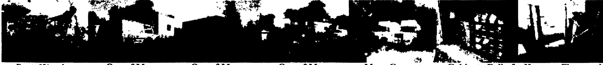
Parts Wrecker Truck One of Many Parts Vans One of Many Beverage Trucks One of Many Truck Tractors More Cement Mixers Cabinets Full of Tools, Bolts Heaters, Floor and Trailer Jacks