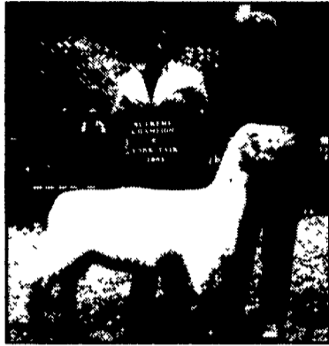
Travis Flory's crossbred ewe was supreme champion in the youth breeding sheep show.