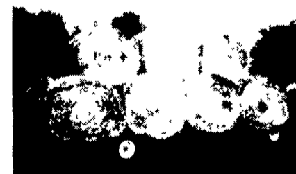
Carries up to 14 bales