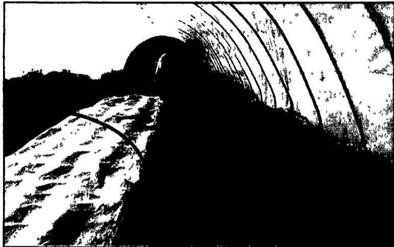
Salad greens in the ground. Plastic hoops and floating row cover provide extra warmth and protection, like an extra blanket on a cold night.

nels start the cash flowing in — not out — for us in late February or early March. They carry us through to Thanksgiving or even Christmas, depending on weather and how hard we want to push ourselves.