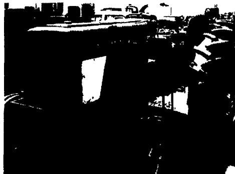
IH 574 Hydro Works Gd Looks Ugly $3,975