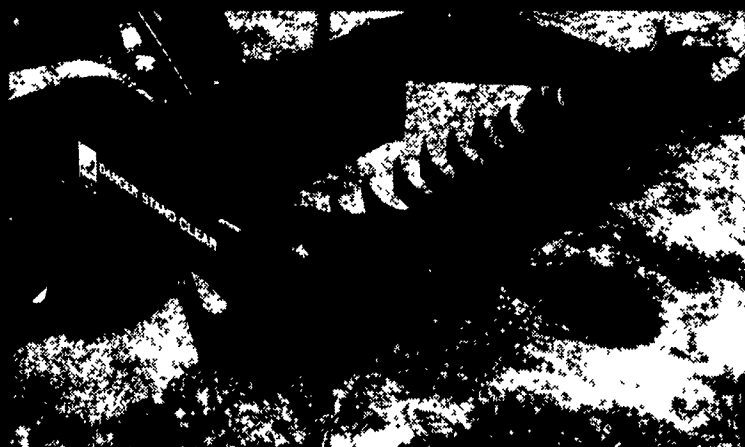
Silage defacer with 96-in. full working width