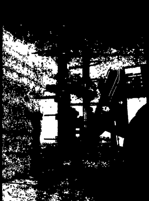
Bale fork (flat eight) handles eight flat or ten indexed square bales