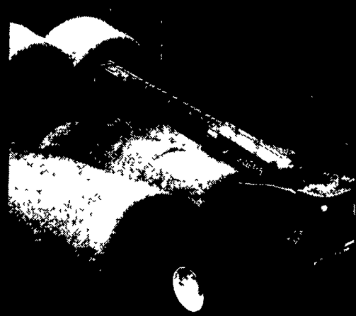
Large square bale spike handles two square bales or two large round bales