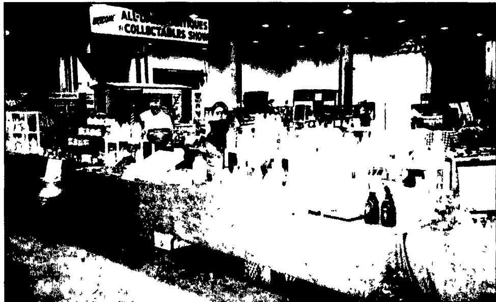
Milk bottles were ubiquitous in last year's show and added beauty, interest, and history.