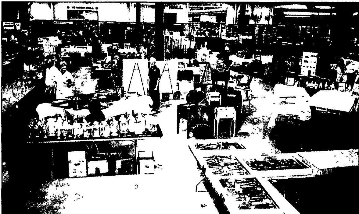
Taken from the seat of the Reist Price's Dairy milk wagon this view shows the size and diversity of the annual show.