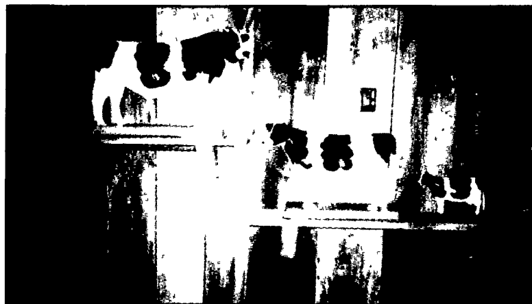
1922 True-type Holstein Bull and Cow 1/4 life-size compared with 1/16 life-size cow will be on display from Penn State University Department of Dairy and Animal Science.

The All-American Dairy Show is scheduled for Sept. 21-25 in the Farm Show Complex in Harrisburg. For information about the All-Dairy Antiques and Collectibles Show or the All-American Dairy Show, contact the All-American office at (717) 787-2905, or e-mail aads@state.pa.us.