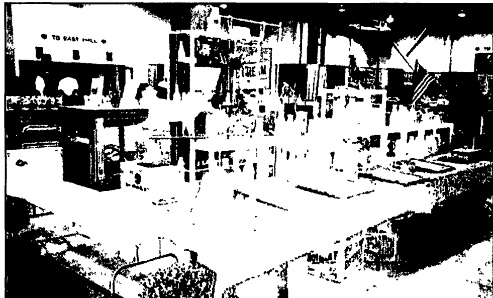
Dairy memorabilia exhibited at the All-Dairy Antiques and Collectibles Show can be bought and sold, but is also educational.